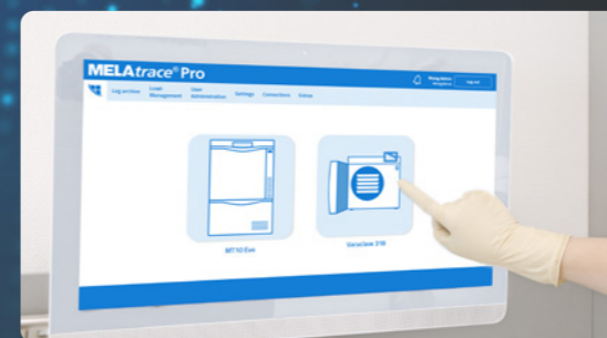
✓ Documentation & approval with MELAttrace