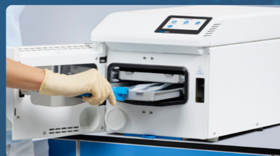
✓ Steam sterilization with Vacuclave 105 / 305