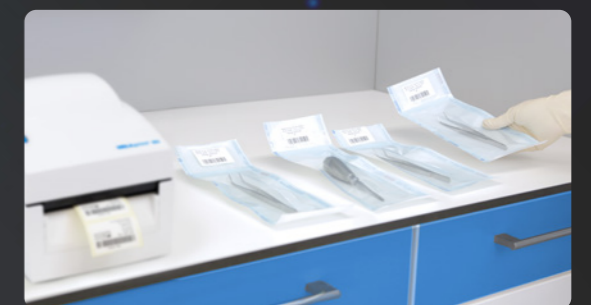
✓ Labeling with MELAprint 80