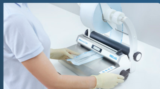
✓ Packaging with MELAseal or MELAstore